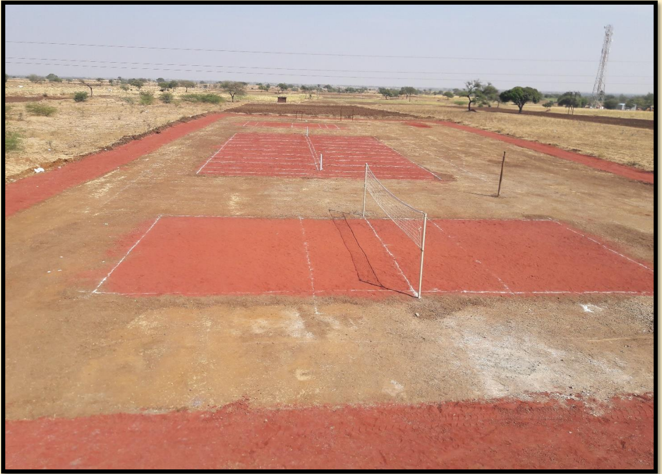
Running & Walking Track with Play field of Kabaddi, Kho-Kho and Volley-ball